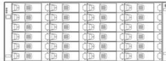
HPE 3PAR StoreServ 8000 LFF(3.5in) SAS Drive Enclosure