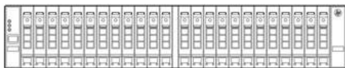
HPE 3PAR StoreServ 8000 Storage (2-Node Storage Base)

HPE 3PAR StoreServ 8000 is storage made effortless.