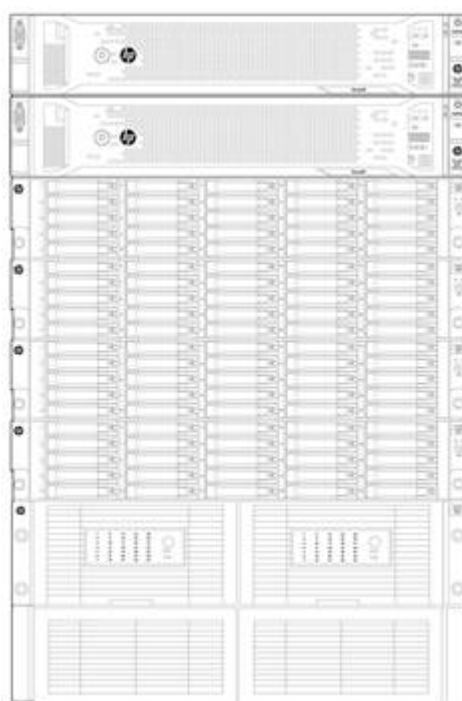
HPE StoreAll 8000 Couplet configured with ENT SAS and MDL SAS Capacity Blocks